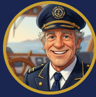
CHART A COURSE FOR SUCCESS